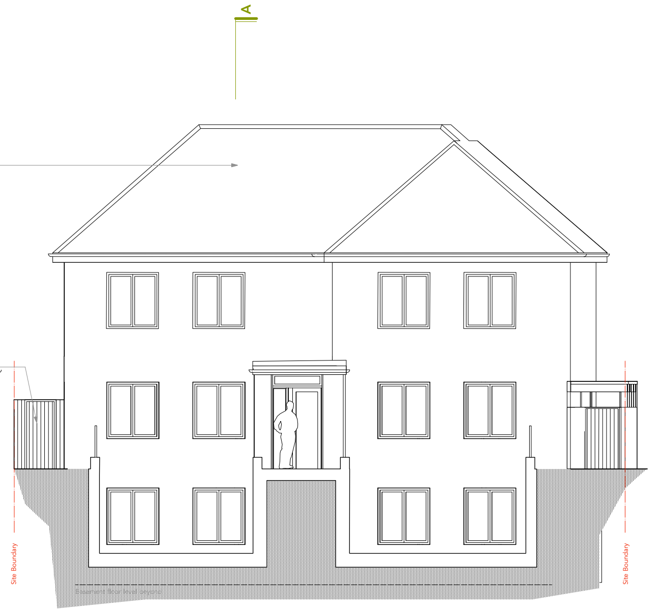
ELE Proposed Front Elevation (including section through Basement lightwells)