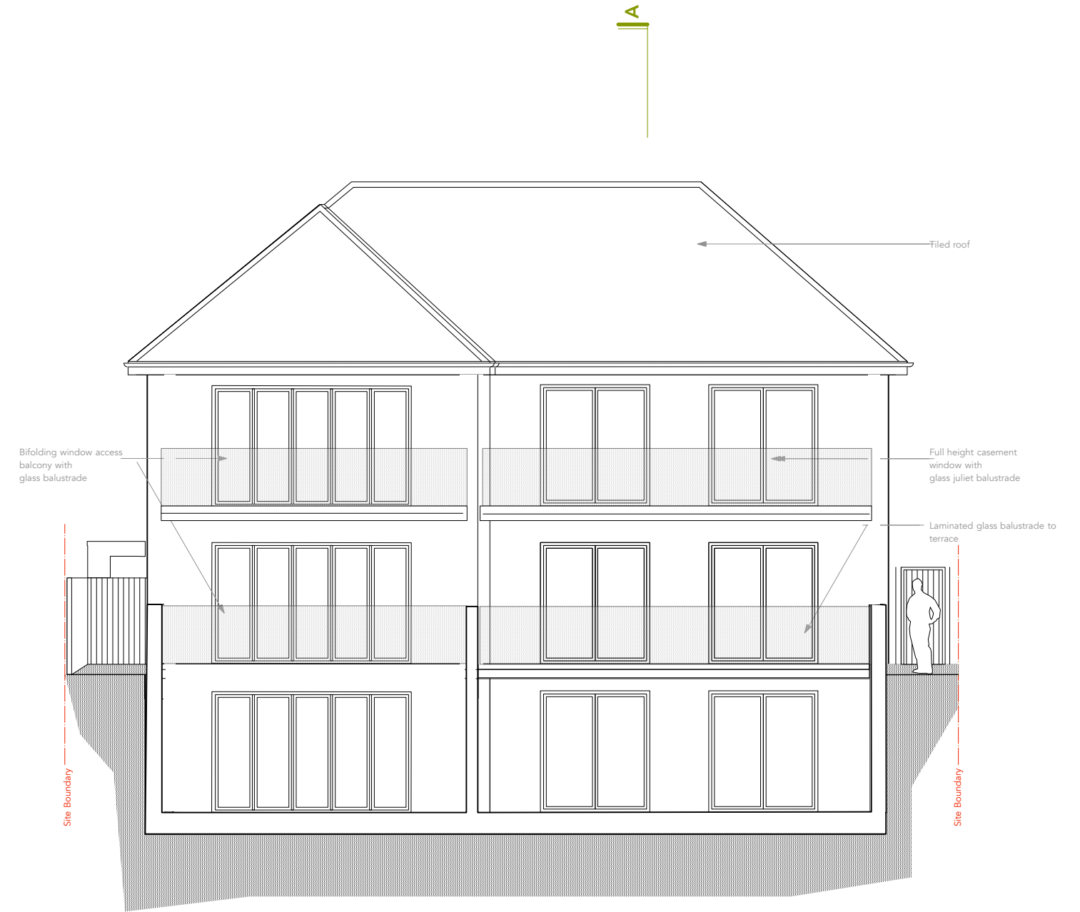
ELE Proposed Rear Elevation (including Basement terrace)

G Balconies added at rear 07.08.2015 F Planning Issue 01.06.2015