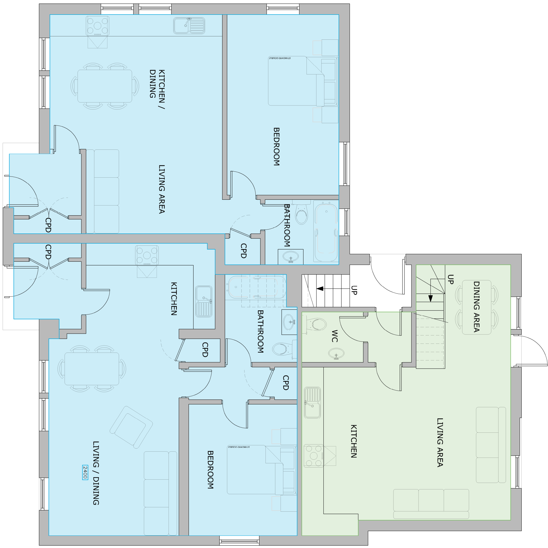
PROPOSED GROUND FLOOR PLAN (DEDWORTH BUILDING) SCALE 1:50